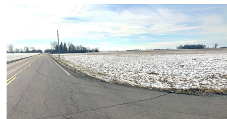
PICTURED ABOVE LEFT: View from southeast