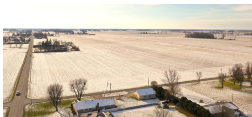
PICTURED BELOW: View from northeast