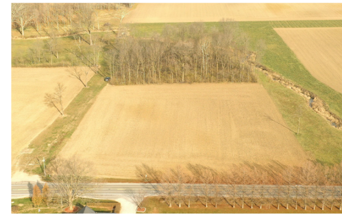
EAST TRACT FROM SOUTH