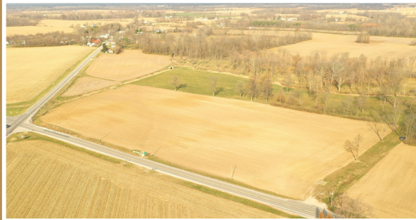
WEST TRACT FROM SOUTHEAST