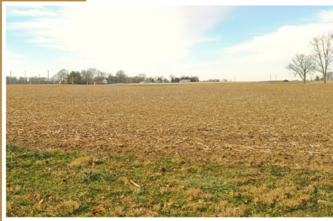
WEST TRACT FROM E