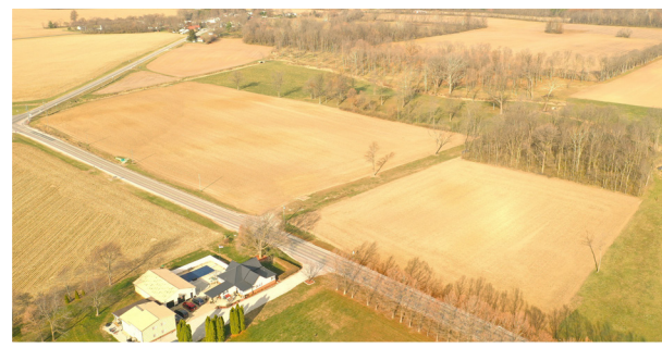
WHOLE FARM FROM SOUTHEAST