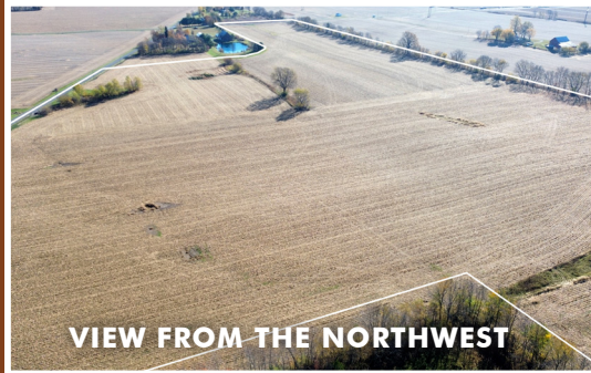
VIEW FROM THE NORTHWEST