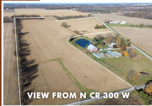
VIEW FROM N CR 300 W