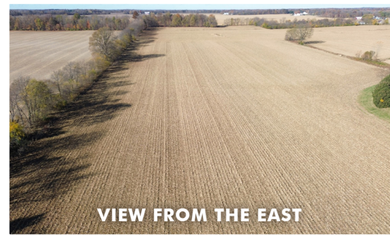
VIEW FROM THE EAST