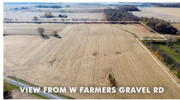
VIEW FROM W FARMERS GRAVEL RD