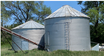
5,000 bu & 2,500 bu Grain Bins & 20 x 48 Pole Building